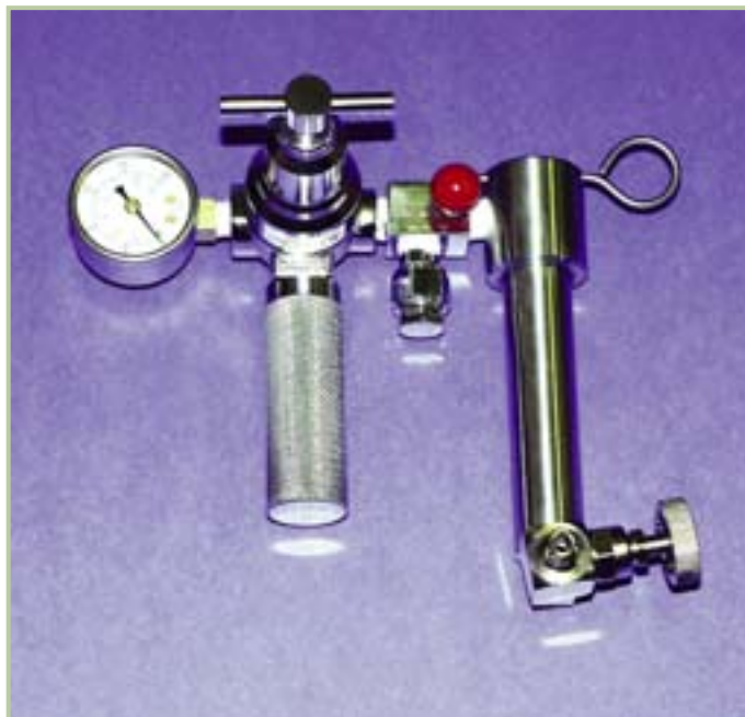
#170-06 Back Pressure Receiver